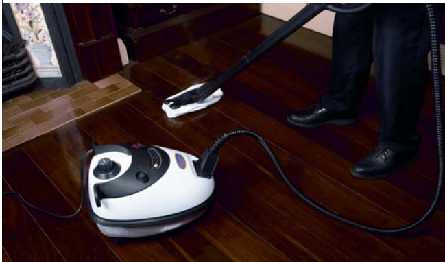
TR5 STEAM CLEANER