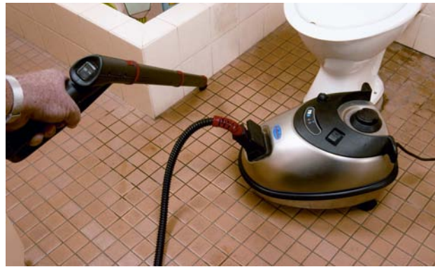
TR6 CONTINUOUS STEAM